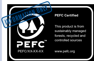
3. White on solid background