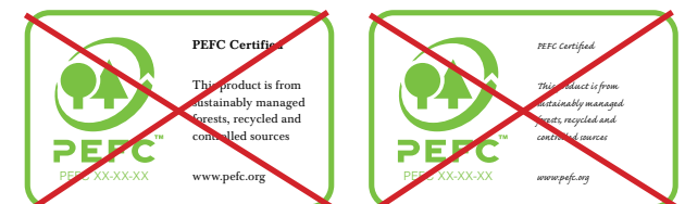
Do not change the typeface of the label content