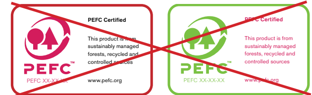
Do not change the colour of any of the label parts