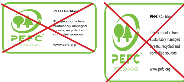
Do not stretch the label in any way