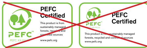
Do not change the proportions of the label content in any way

It is essential that the PEFC labels are reproduced consistently and correctly. The labels must not be altered in anyway except for the insertion of the logo license number, scaling, and modifications as outlined in Section B. Proportions of the label shall not be changed when increasing or reducing the label size.