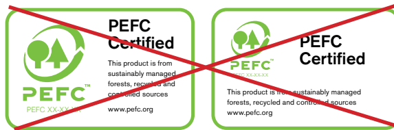
Do not change the proportions of the label content in any way

It is essential that the PEFC labels are reproduced consistently and correctly. The labels must not be altered in anyway except for the insertion of the logo license number, scaling, and modifications as outlined in Section B. Proportions of the label shall not be changed when increasing or reducing the label size.