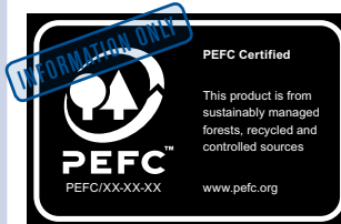
3. White on solid background