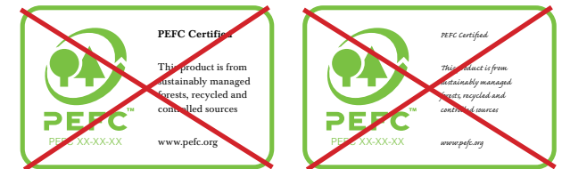
Do not change the typeface of the label content