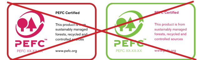
Do not change the colour of any of the label parts