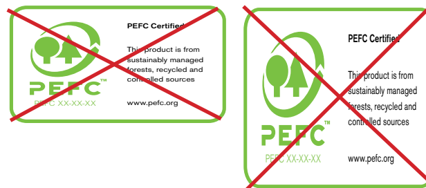
Do not stretch the label in any way